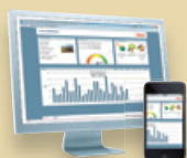
StecaGrid Portal Web portal