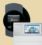
Solar-Log™ and Meteocontrol WEB'log Accessories