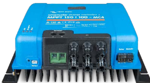
Solar Charge Controller MPPT 150/100-MC4 without display